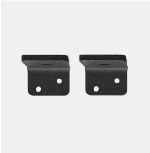
Hidden fittings Black