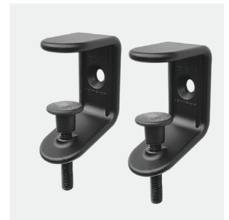
Clamp fittings Black, white or grey