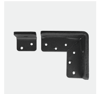
(2 x) Hidden fittings Black