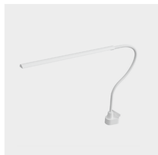
Flexible LED lamp