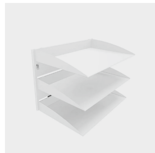
Sorting compartment 3xC4