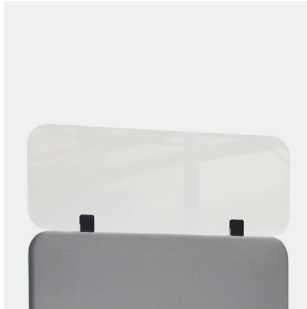
Plexi upper section 800/1000/1200/1400/1600/1800/2000 x285 mm