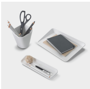
3-pack components wide shelf/narrow shelf/pen cup