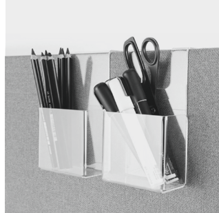
Plexi pen holder