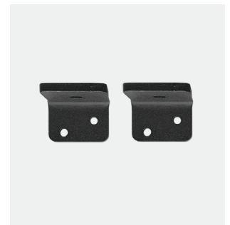
Hidden fittings Black