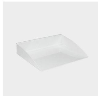
System shelf C4