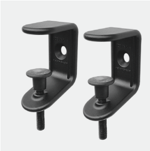
Clamp fittings Black, white or grey