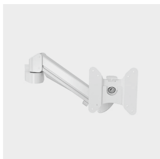
Monitor arm LC55