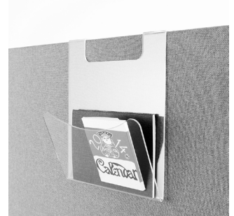
Plexi letter holder